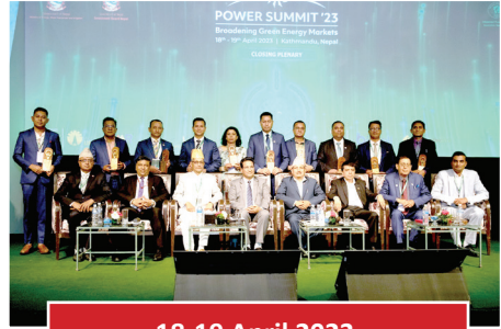
18-19 April 2023

The Power Summit serves as a key platform for promoting renewable energy, fostering a collaborative business environment, and offering valuable insights into the latest technologies, policies, and energy-related developments. It attracts a diverse range of participants, including policymakers, politicians, national & international experts, academia, national & international Government representatives, all the stakeholders, manufacturers, suppliers, consultants, financial institutions, banking and insurance companies, national & international vendors, contractors, construction companies etc. all coming together to explore innovative solutions and opportunities for growth in the energy sector.