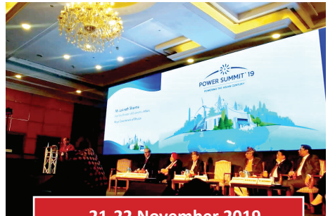
21-22 November 2019