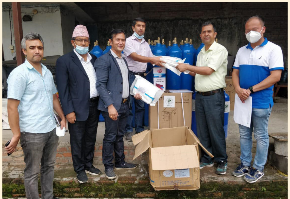
Oxygen Cylinder handed over to Rukum Hospital