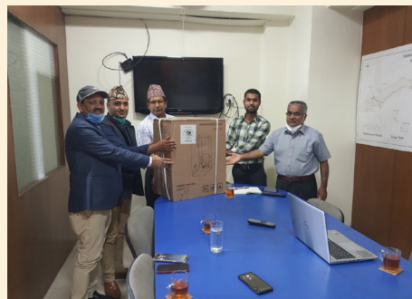
Oxygen Cylinder handed over to Lumbini Province Hospital