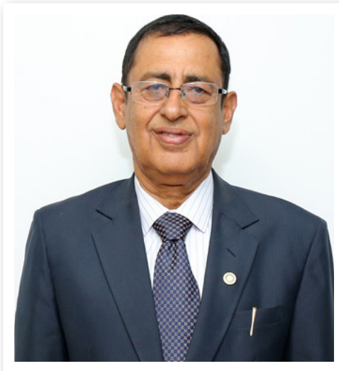
???? - President, IPPAN

Over the last year, the committees have been actively advocating with concerned government agencies based on the action plan prepared by each committee