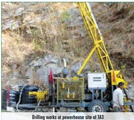
Drilling works at powerhouse site of TA3

small hydropower projects that can be installed at the shortest time. If it wants to address the power deficit problem, the role of quick viable projects will be crucial. Lower Modi Khola Hydroelectric Project (20MW) is one such project. The foundation stone of this project was laid on March 4, 2009. Situated in Parbat District, this project is a Run-of-River type having 20 MW installed capacity. With the source river Modi, this project will be able to generate about 124 GWh of energy annually. The project requires no additional access road and only about 4.5 km transmission line to connect it to the National Grid. If it gains support from all quarters, this project can be constructed in 2.5 years time. The project has already obtained financial commitment from Nepal Investment Bank Limited. The contract for the office building has been awarded. The detail design is currently under final review for construction. Hydro Solutions Group, K.L Dugar Group, Murarka Group and Debenara Group are promoting this project.