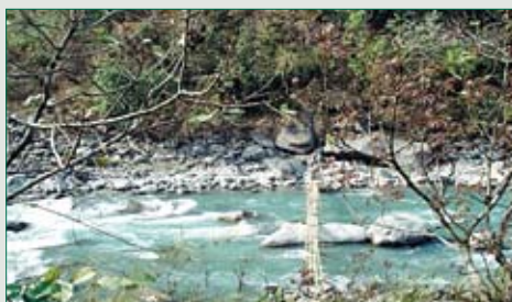
Middle Tamor Dam