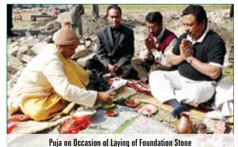
Puja on Occasion of Laying of Foundation Stone