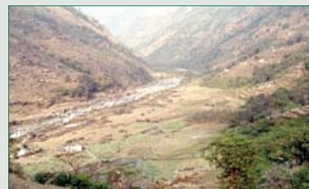
View of Head works area of Upper Tamor, Tapethok